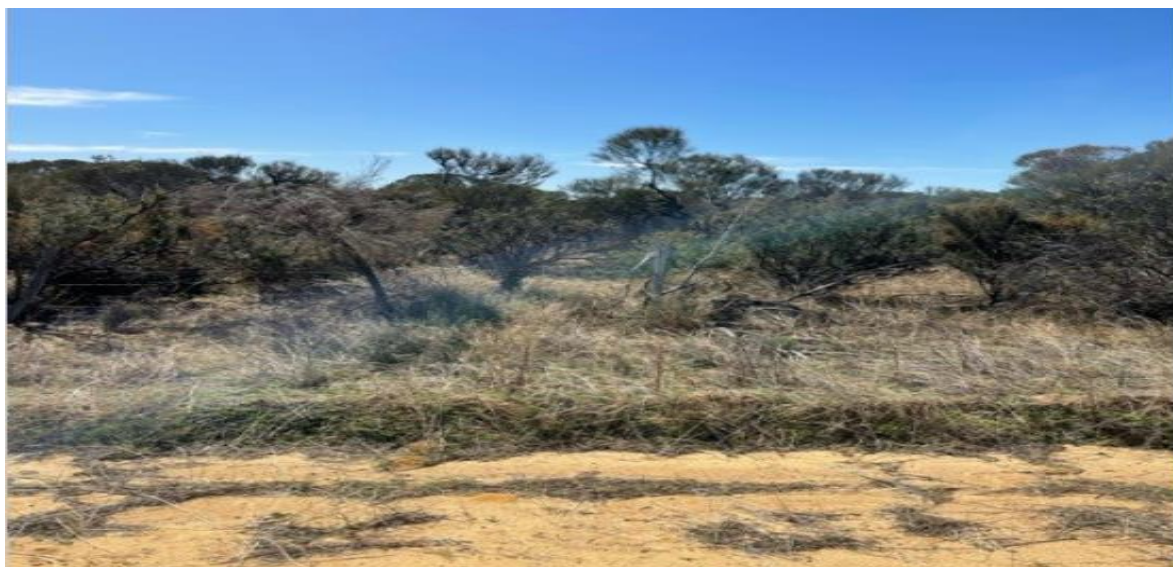
Figure 4. Photograph of vegetation proposed to be cleared (Pedrin, 2023)