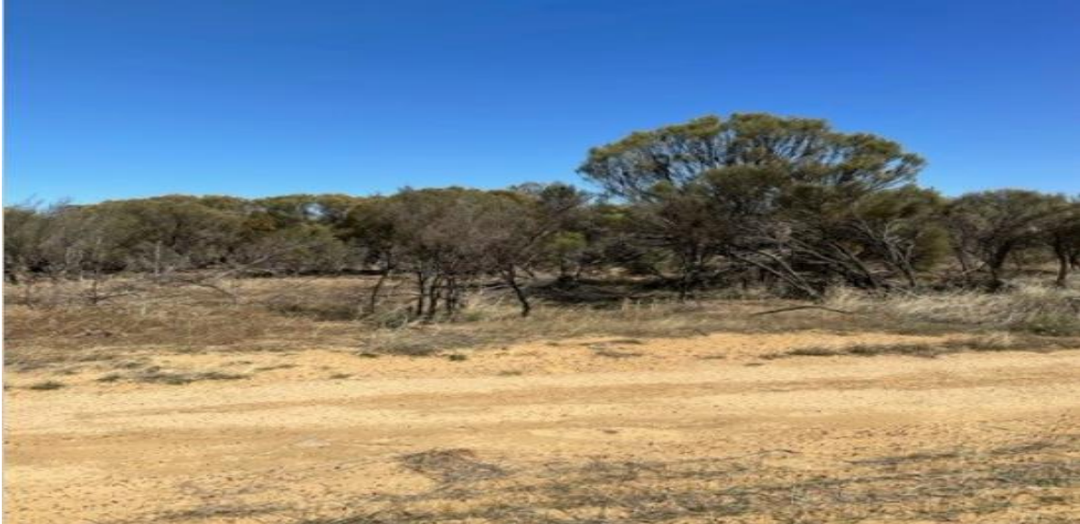
Figure 2. Photograph of vegetation proposed to be cleared (Pedrin, 2023)