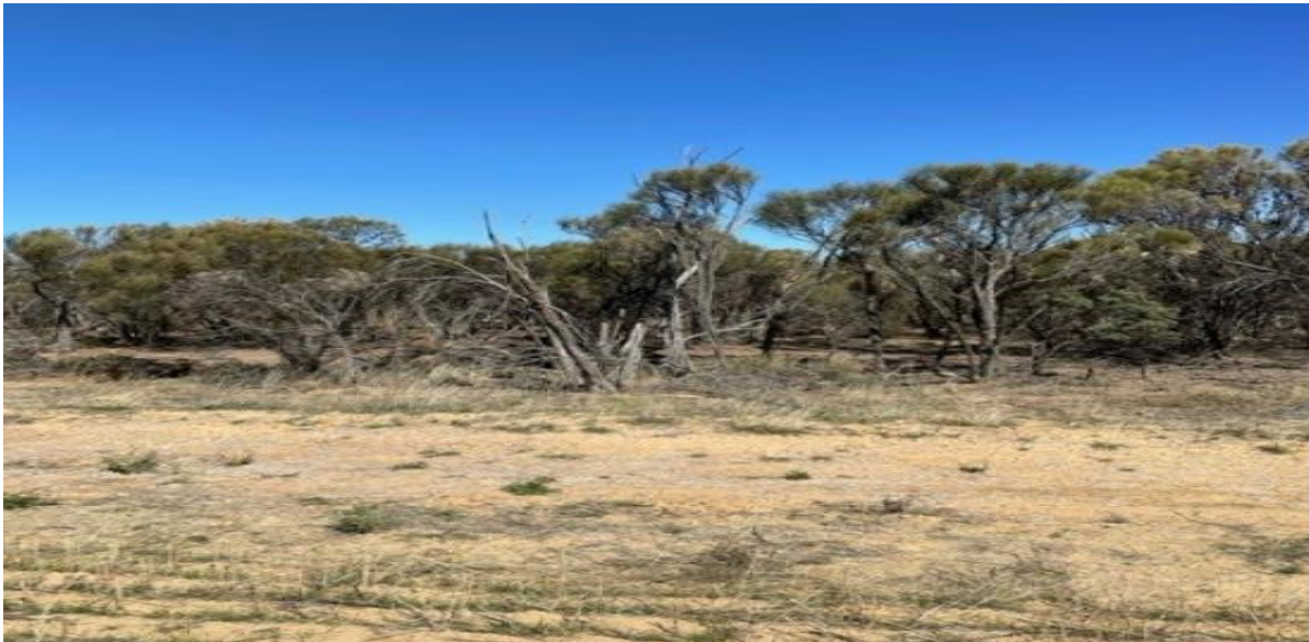
Figure 3. Photograph of vegetation proposed to be cleared (Pedrin, 2023)